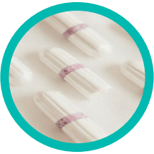
Tampons and applicators